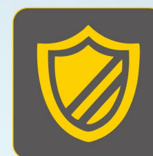
安全可靠 SAFE AND RELIABLE