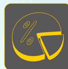
配比准确 MATCHING ACCURACY