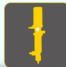
结构简单 SIMPLE STRUCTURE