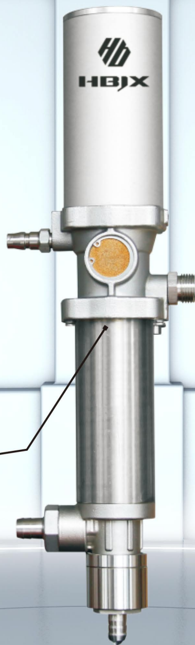
PNEUMATIC PROPORTIONING PUMP 气动配比泵

"Haibao" brand pneumatic medicine liquid ratio pump overall use of special Stainless steel pipe fitting, combined with physics piston siphon principle, and original creation Add pneumatic elements to the air as a power source, and designed A new type of pharmaceutical liquid mixing equipment. Its main characteristics of strong power, outlet pressure, stability Good performance, a device can meet multiple working points at the same time Operation needs, has the high use value.